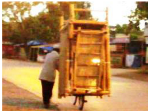
Fig. 4. Sell bale-bale with bike

The main principle of the bale-bale is a simple shape, light, and not too large (typically measuring 1m x1.5m), and the construction is easy to do. This causes easily moved or sold with the bike. Figure which shows how to sale Bale-bale by using bike around the town is as follow.