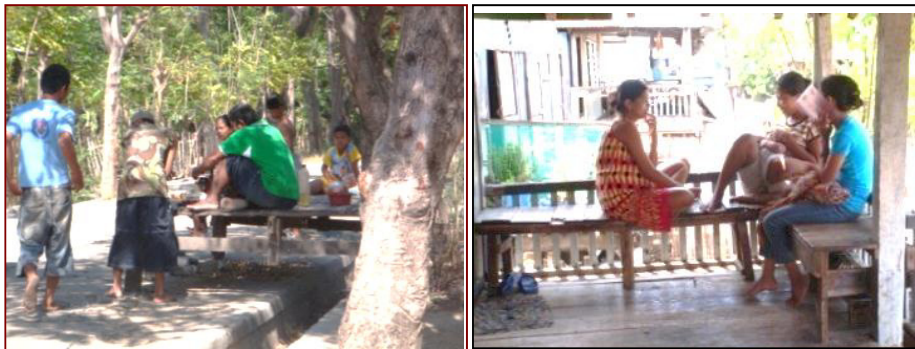
(c) At the edge of the road and on the porch stage