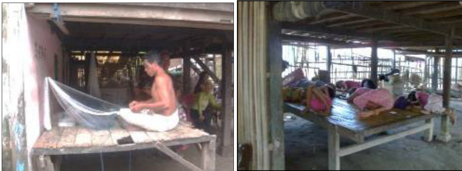
(b) Workplace and take a nap