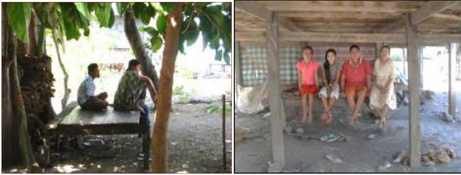
(a) In the backyard and underneath the house (kolong)