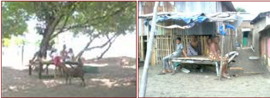
(b) Under the tree and open spaces around the coast