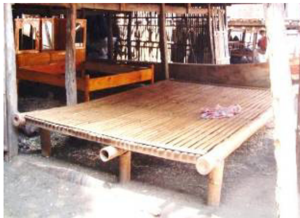
Fig.1. The shape of bale-bale

Bale-bale is a simple-designed place, easily moved, cheap, and easy to find which makes it usable by many people. The following is picture of bale-bale: