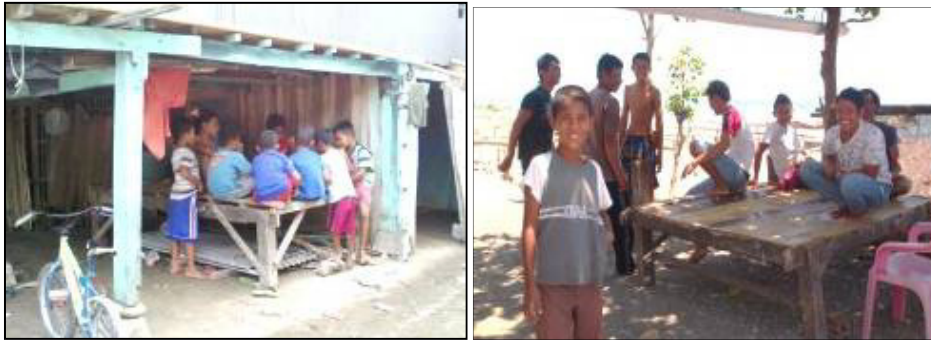
(a) Places for children to play and a place to socialize / communicate for adults